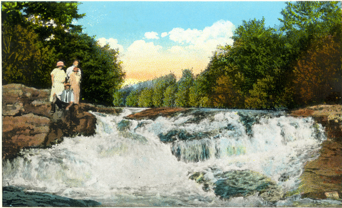
The falls at Austin T. Blakeslee Natural Area.